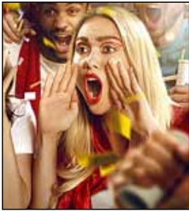
CRAZY: Game action